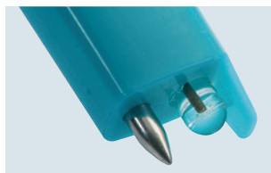
testo 206-pH1: pH1 probe head for liquids