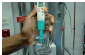
Ideally suitable for monitoring heating system water according to VDI 2035.