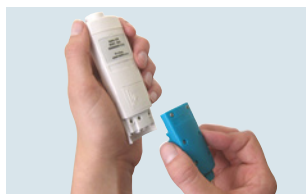
Easy exchange of probes with testo 206-pH1/-pH2/-pH3