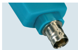
testo 206-pH3: pH3 probe head with BNC interface